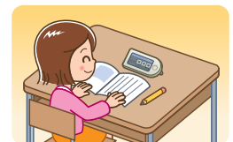
Comes with a standard tables.