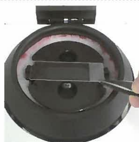
① the slide glass set