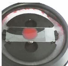
② dropped in the middle of the slide glass (0.25ml blood)